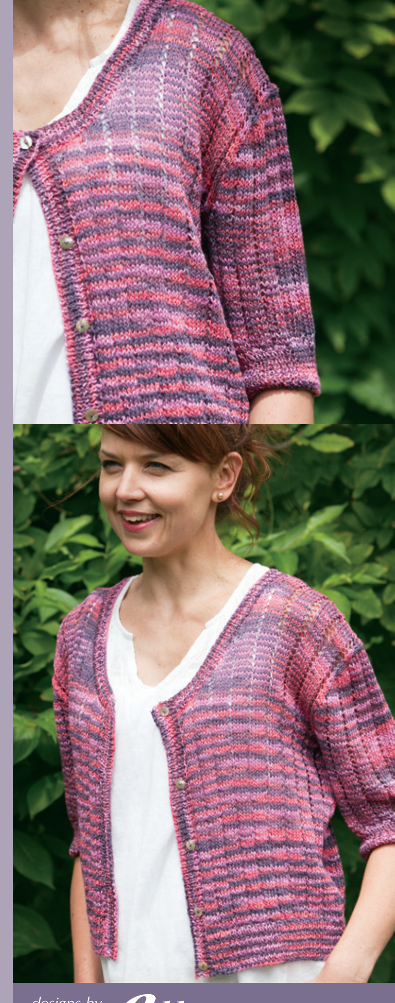
designs by Ella rae