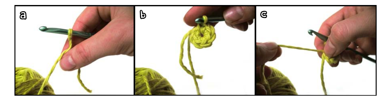
Want to see the sloppy slip knot in action? Watch my video on the sloppy slip knot!

Most pieces in this pattern (as they are based on circles) begin with stitching six times into one loop. I recommend the 'sloppy slip knot' to avoid creating a hole in the center. To do this, twist the yarn around the hook to begin (a), and crochet as directed. Once you have completed your first round (b), pull on the tail, while holding the work you have created (c). The center hole will close right up!