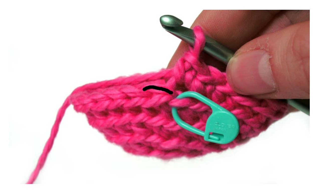
Want to see crocheting through the back loop in action? Watch my video on crocheting through the back loop!

will change the look of the final product.