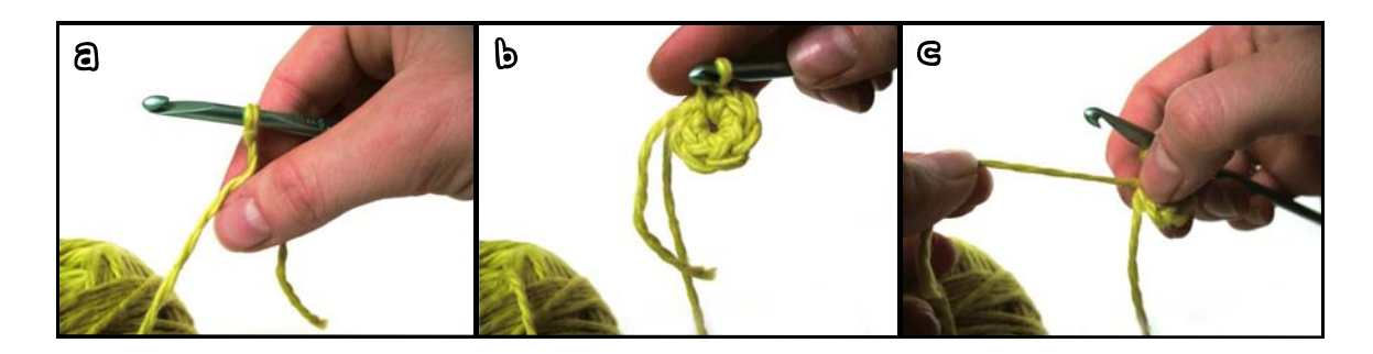
©2012 Knitting Fever, Inc & FreshStitches. All rights reserved. This pattern is for personal use only, and may not be distributed or sold without written consent.

Most pieces in this pattern (as they are based on circles) begin with stitching six times into one loop. I recommend the 'sloppy slip knot' to avoid creating a hole in the center. To do this, twist the yarn around the hook to begin (a), and crochet as directed. Once you have completed your first round (b), pull on the tail, while holding the work you have created (c). The center hole will close right up!