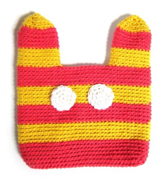
Attach eyes to head. Mine are attached at rounds 16-21, and spaced about 5 sts apart.