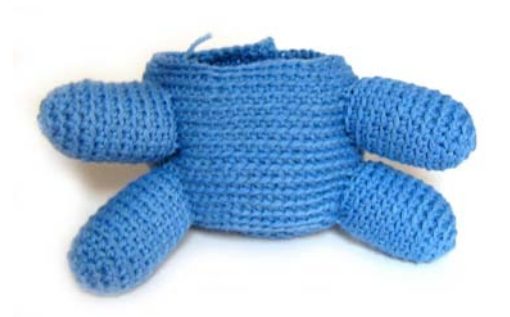
Stuff arms and legs. Attach legs to rounds 9-13 and arms to rounds 16-20.