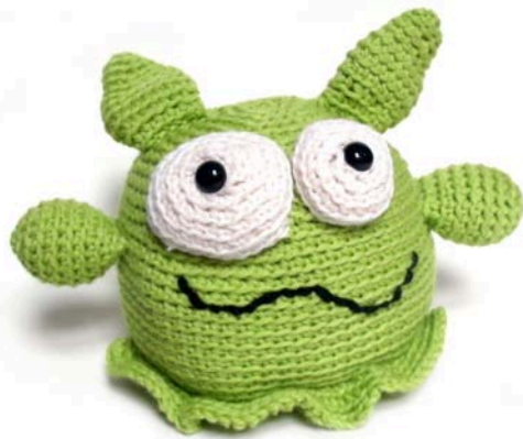
Lark, the monster