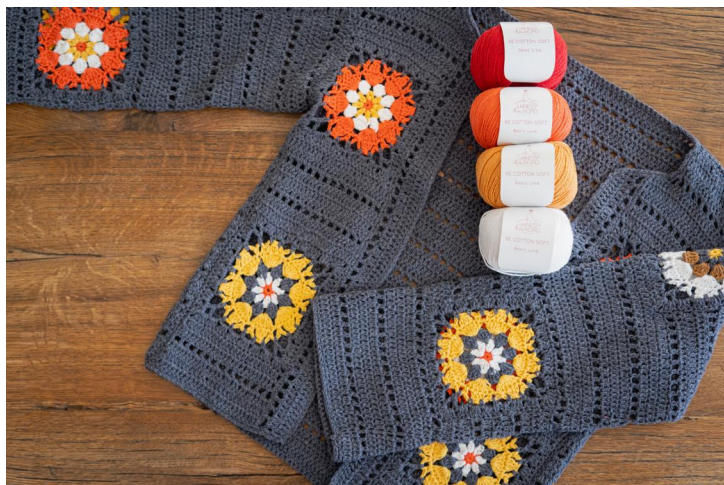
Schema 1: piastrella