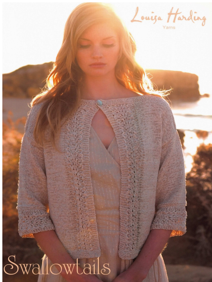
#009 - Swallowtails by Louisa Harding