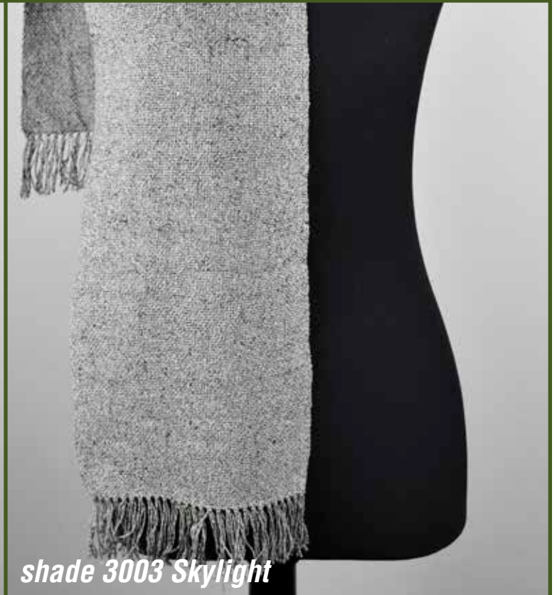
shade 3003 Skylight