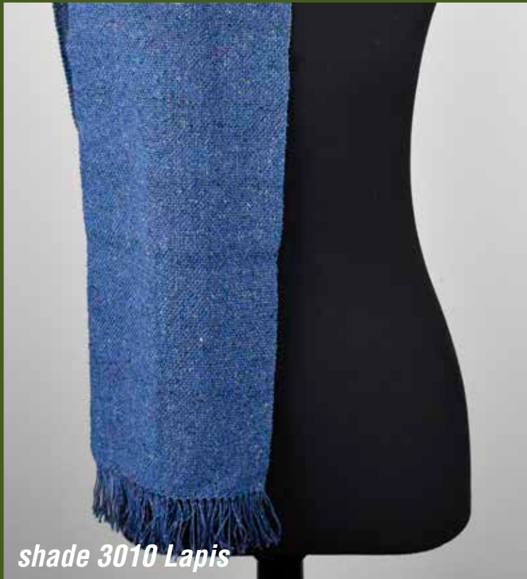
shade 3010 Lapis