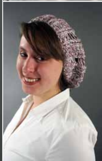
KAKADUWINTER SNOW CAP